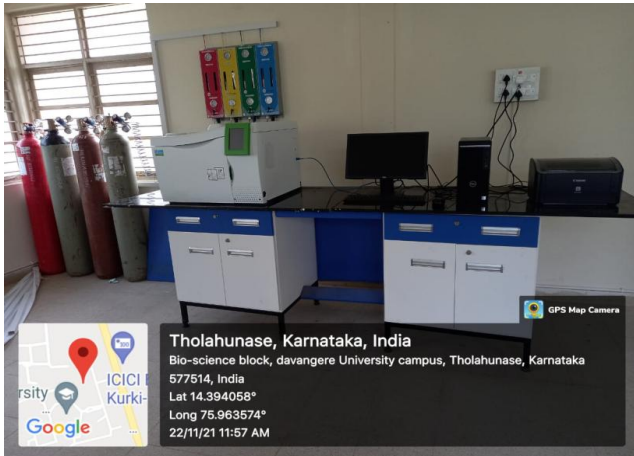
Gas Chromatography equipment