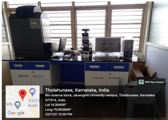
Chemiluminescence and Fluorescent Microscope