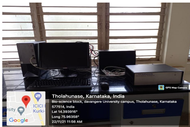
Electrochemical work station